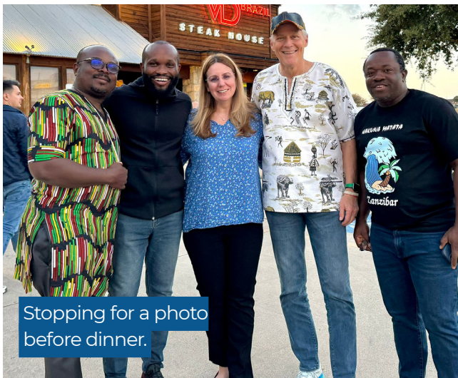
Stopping for a photo before dinner.