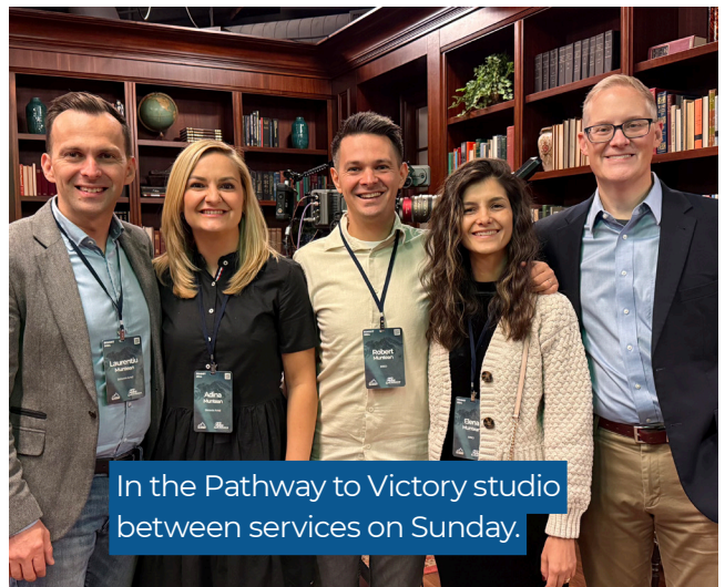
In the Pathway to Victory studio between services on Sunday.