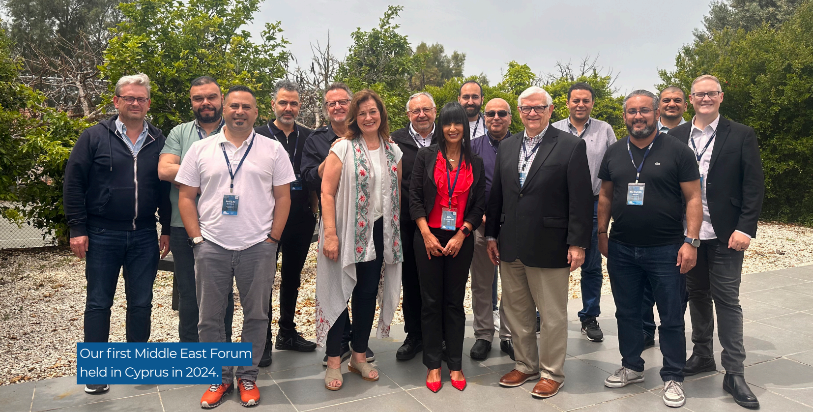
Our first Middle East Forum held in Cyprus in 2024.