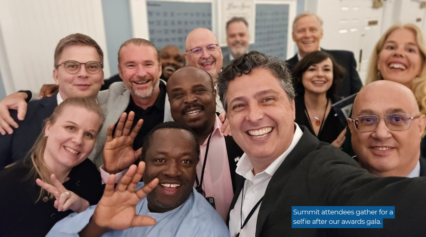
Summit attendees gather for a selfie after our awards gala.